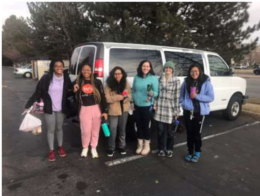
Students from our Colorado Campus Ministries traveled together to Memphis for the Lutheran Student Movement Gathering.

Auraria Campus Ministry is a newly-forming, missionally-minded ministry for young adults in Denver - centered at the Auraria Campus for Higher Education and supported by the RMS, ELCA Youth and Young Adults grant, Holy Trinity Lutheran (Littleton) and House for All Sinners and Saints (Denver). We are excited to develop this important ministry that seeks to foster inclusive community and leadership development among students. With the start of the new year and semester, we will gather weekly over a shared meal and will offer regular presence on campus of lay-led pastoral support.